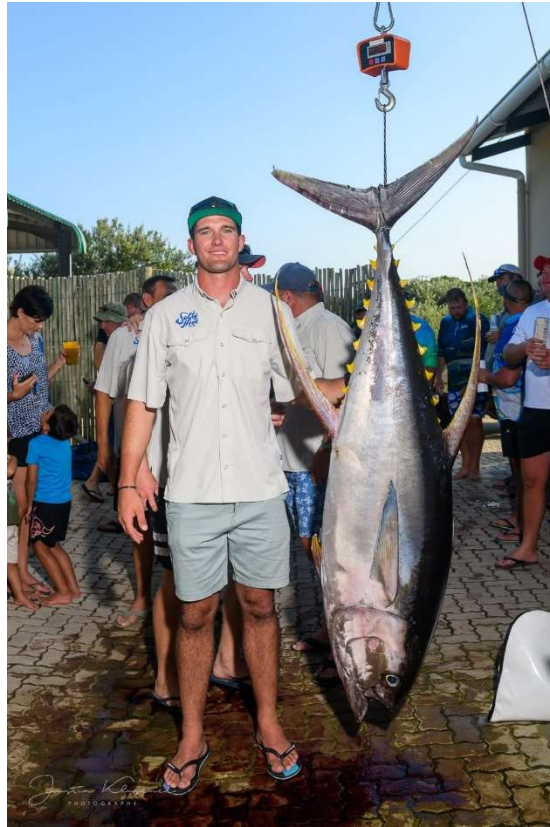
80Kg Tuna Wednesday.