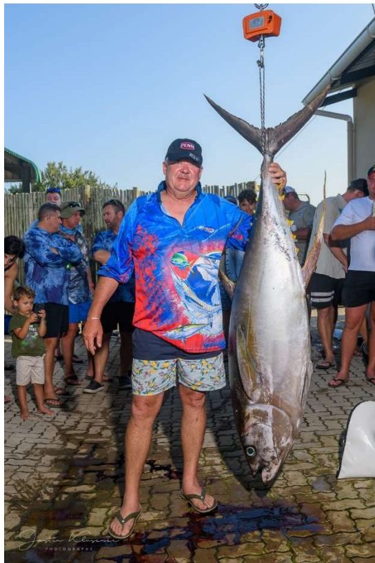
76Kg Tuna Wednesday.