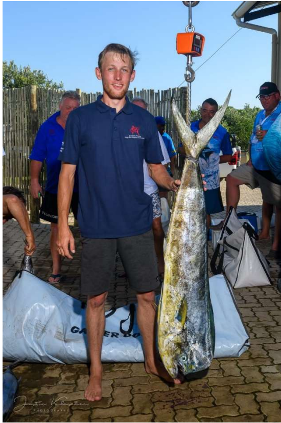
Biggest game fish Thursday.