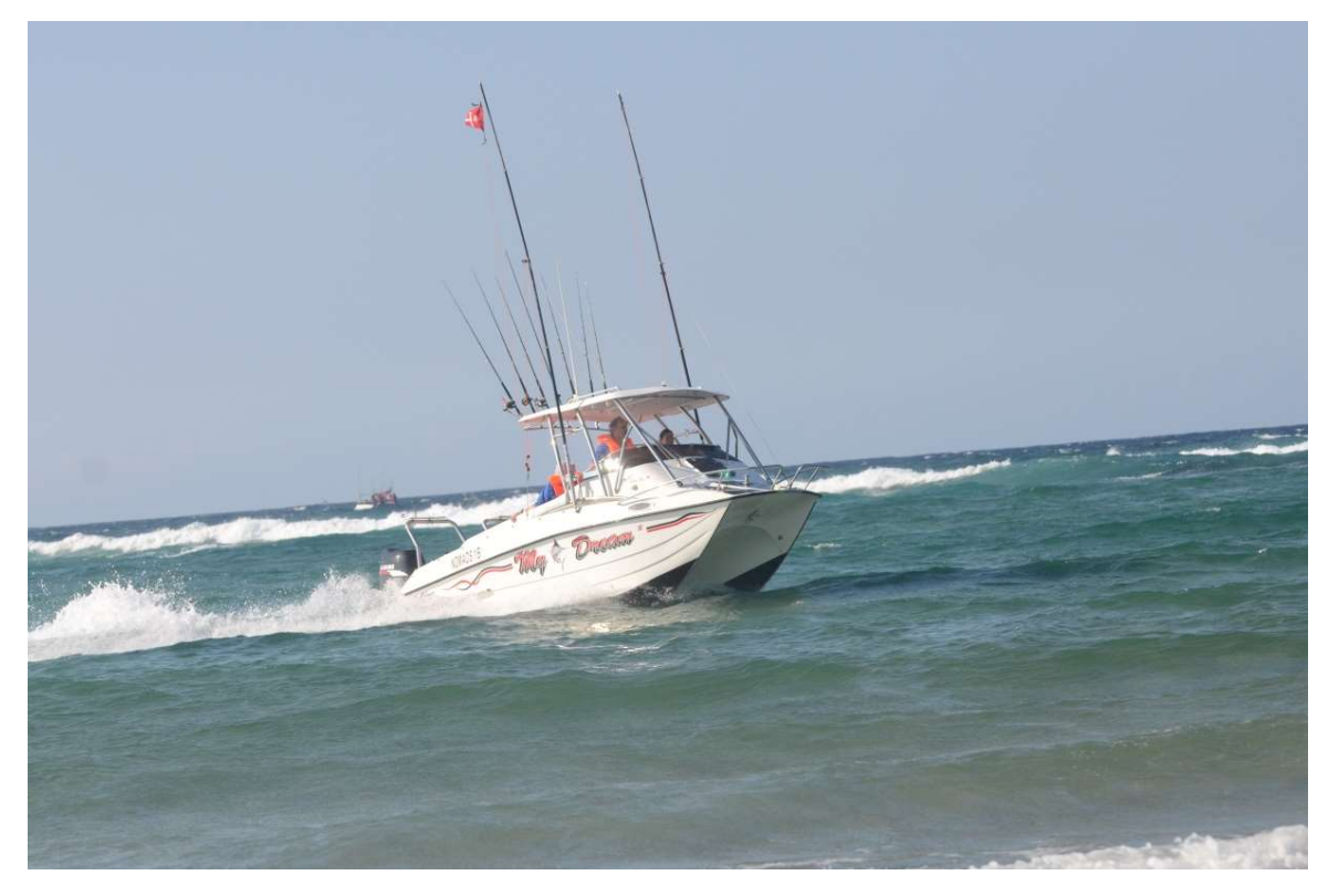
Rosebowl – Sodwana Bay 2013 – Magriet released her First Sailfish on 6kg line