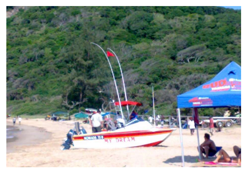
"My Dream" Nomads Closed – Ponta 2008