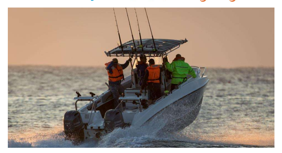
How to be a better crew member.

"Ag, I just couldn't get good people on board"