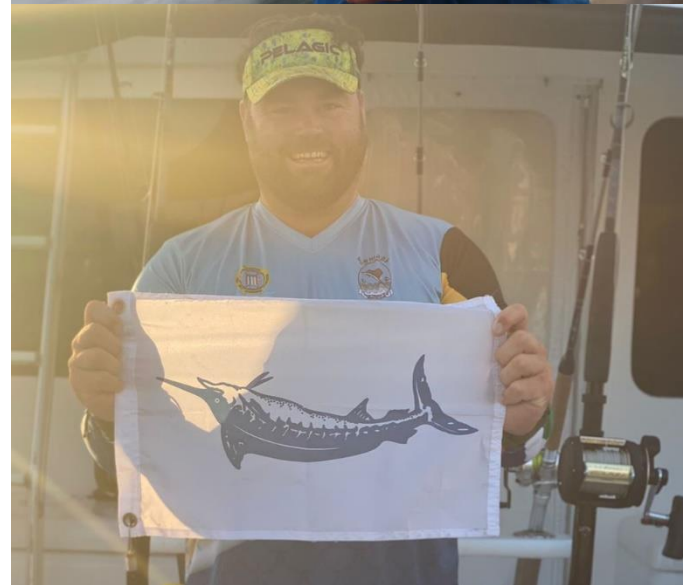
An "upside down" flag indicates a released fish