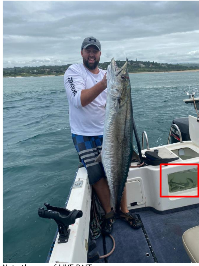
Note the use of LIVE BAIT.