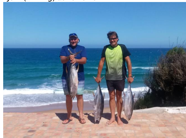
Nauti Boy at Zavora