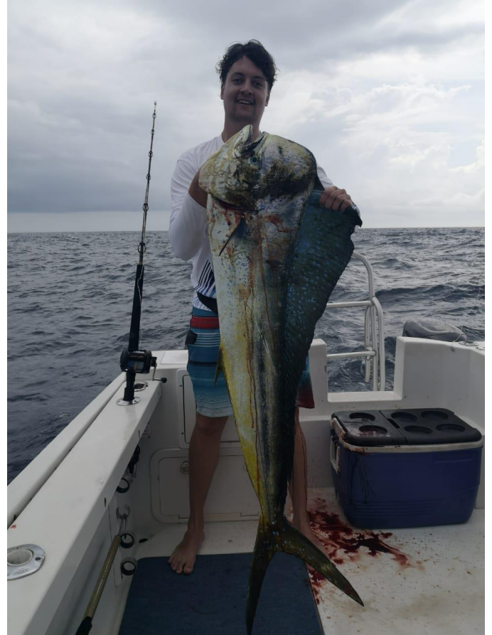
Greg Canny - Finding Nemo