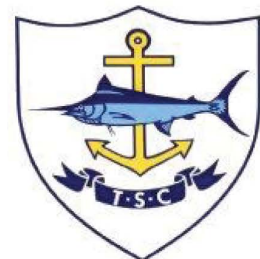
Transvaal Ski-Boat Club