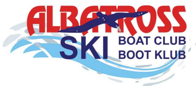
Albatross Ski-Boat Club