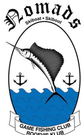
Nomads Game Fishing Club (Hosts)