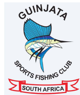
Guinjata Sports Fishing Club