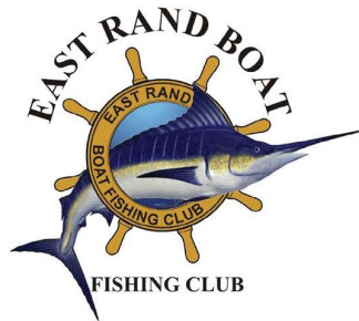
East Rand Boat Fishing Club