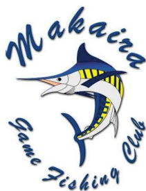
Makaira Game Fishing Club